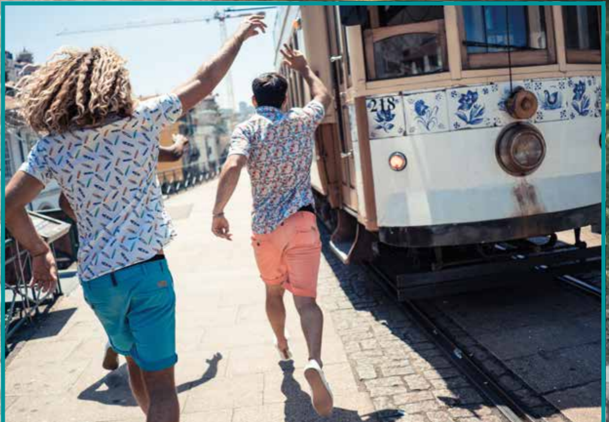
Summer is a state of mind